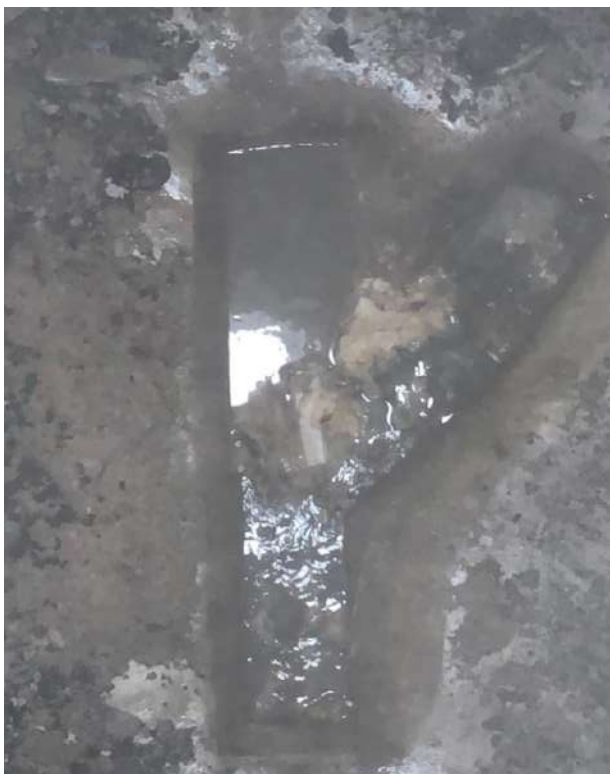
MH06 Pre Clean p- Concrete in bottom of MH.