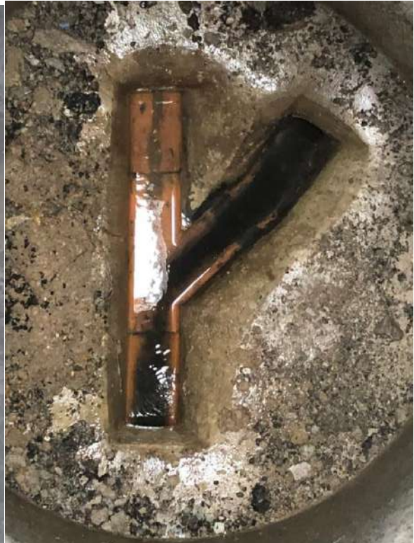
MH06 Post Clean – All running clear.

43 High Street, Uppermill, Oldham, Greater Manchester. OL3 6HS.